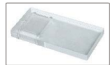
calibration block (included)