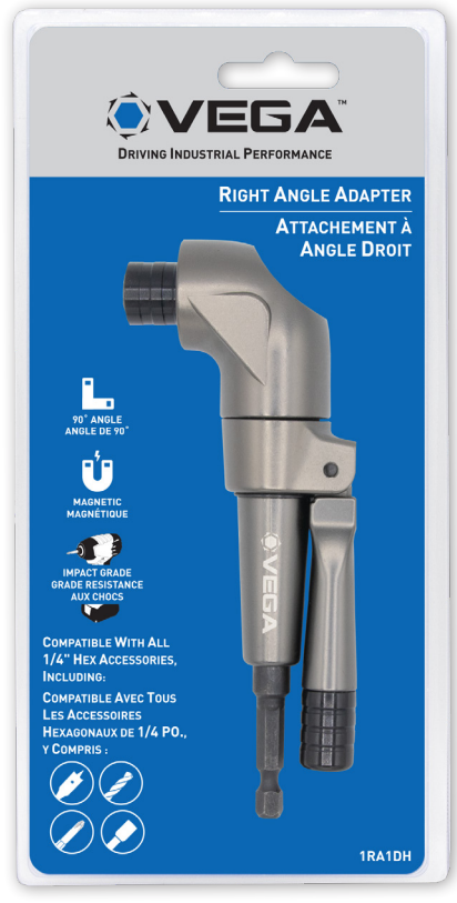
Part Number: 1RA1DH